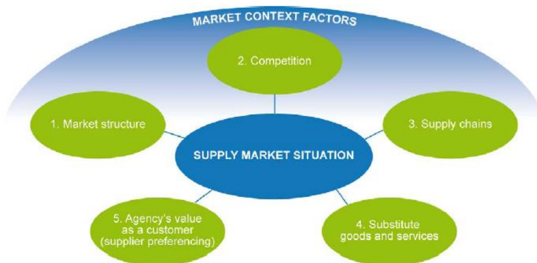
Figure 1: The supply market analysis framework

In addition, economic, socio-cultural, technological, environmental, sustainability and legal factors should be analysed. This will assist in identifying supply-related risks and opportunities.